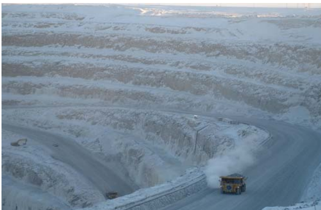
Diavik Diamond Mine, NWT

The Ekati Diamond Mine , owned by BHP Billiton is a large multiple open pit and underground diamond mining operation located in the Northwest Territories north of Lac De Gras. Although the mine is not in the Kitikmeot Region, there is potential for environmental impacts to the region as a result of mine activities. Therefore, as a stakeholder the KIA must ensure negative effects are avoided and there are benefits to Kitikmeot Inuit resulting from the project.