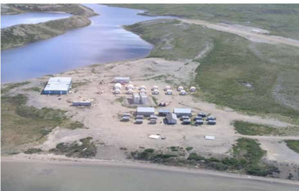
Exploration camp at Ham Lake (Izok Lake area)

The Back River Project is operated by Dundee Precious Metals out of their Goose Lake Camp 160km south east of the community of Bathurst Inlet. The project is in the advanced stages of exploration for gold in the area