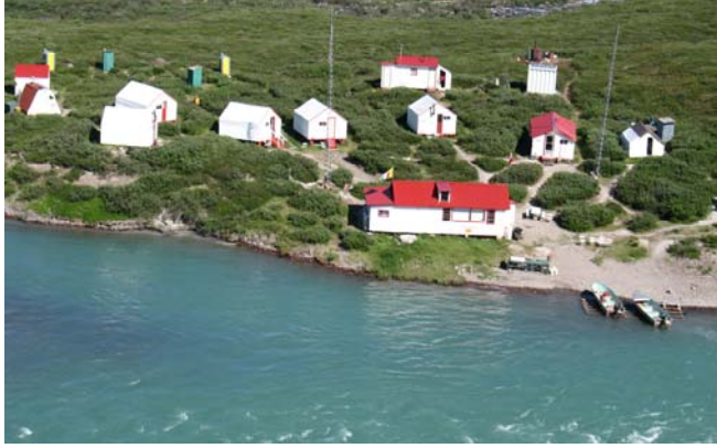
Tree River Lodge

The Tree River Lodge is located on the east bank of Tree River, 130 km east of Kugluktuk. The lodge area is within a parcel of land which becomes IOL as of the start of 2009. Great Bear Lake Lodges is currently negotiating a lease with the KIA to continue operating its lodge here.