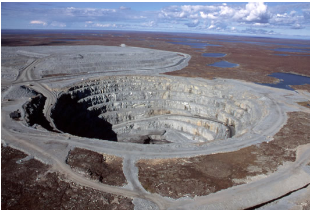
Ekati Diamond Mine, NWT

The Amaruk Project , operated by Diamonds North Resources Ltd. is a grassroots diamond exploration project. Amaruk camp is located 50km south-west of the community of Kugaaruk.