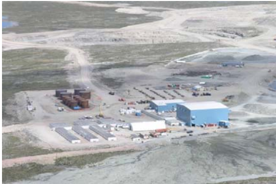
Jericho Diamond Mine

The Jericho Diamond Mine , owned by Tahera Diamond Corporation, was in operation near Contwoyto Lake for 2 years. At the end of 2007, the mine began transitioning to care and maintenance. The mine remains under care and maintenance today.