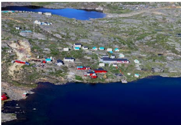
High Lake exploration camp

The Doris North Project is fully permitted to proceed as a small underground gold mine located 75km northeast of Bay Chimo developed by Newmont Mining. Recently, Hope Bay Mining Limited announced they plan on waiting to proceed with Doris North in order to integrate it into a larger, district-wide development. Further exploration of the Hope Bay Green Belt continues with camps south of the Doris North site at Windy Lake and Boston.