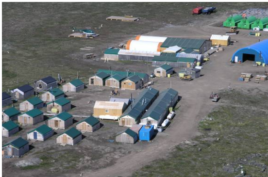
Goose Lake exploration camp

The Hackett River Project , is a project in the advanced stages of exploration with the potential to become a silver/ zinc mine. This project, operated by Sabina Silver Corporation, is located 110km south of the community of Bathurst Inlet.