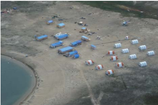
Amaruk exploration camp

The Amaruk Project , operated by Diamonds North Resources Ltd. is a grassroots diamond exploration project. Amaruk camp is located 50km south-west of the community of Kugaaruk.