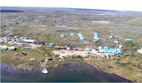
Hackett River exploration camp

The Hackett River Project , is a project in the advanced stages of exploration with the potential to become a silver/ zinc mine. This project, operated by Sabina Silver Corporation, is located 110km south of the community of Bathurst Inlet.