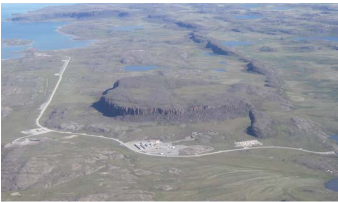
Doris North camp and road to Roberts Bay

The Jericho Diamond Mine , owned by Tahera Diamond Corporation, was in operation near Contwoyto Lake for 2 years. At the end of 2007, the mine began transitioning to care and maintenance. The mine remains under care and maintenance today.